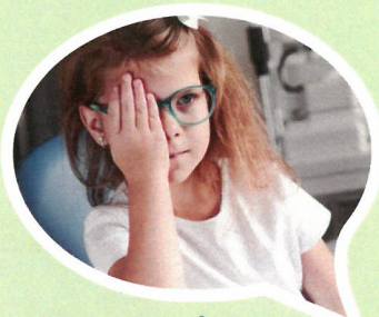
Concerns about hearing or vision